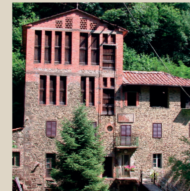
The Calamari paper mill

T he opening of the Museum of Paper in Pietrabuona created the opportunity of bringing to life many projects designed to recuperate the historical, economic and social memory of the area, projects concerning the culture of work and business, to recover the identity of the places and to enhance the productive heritage.