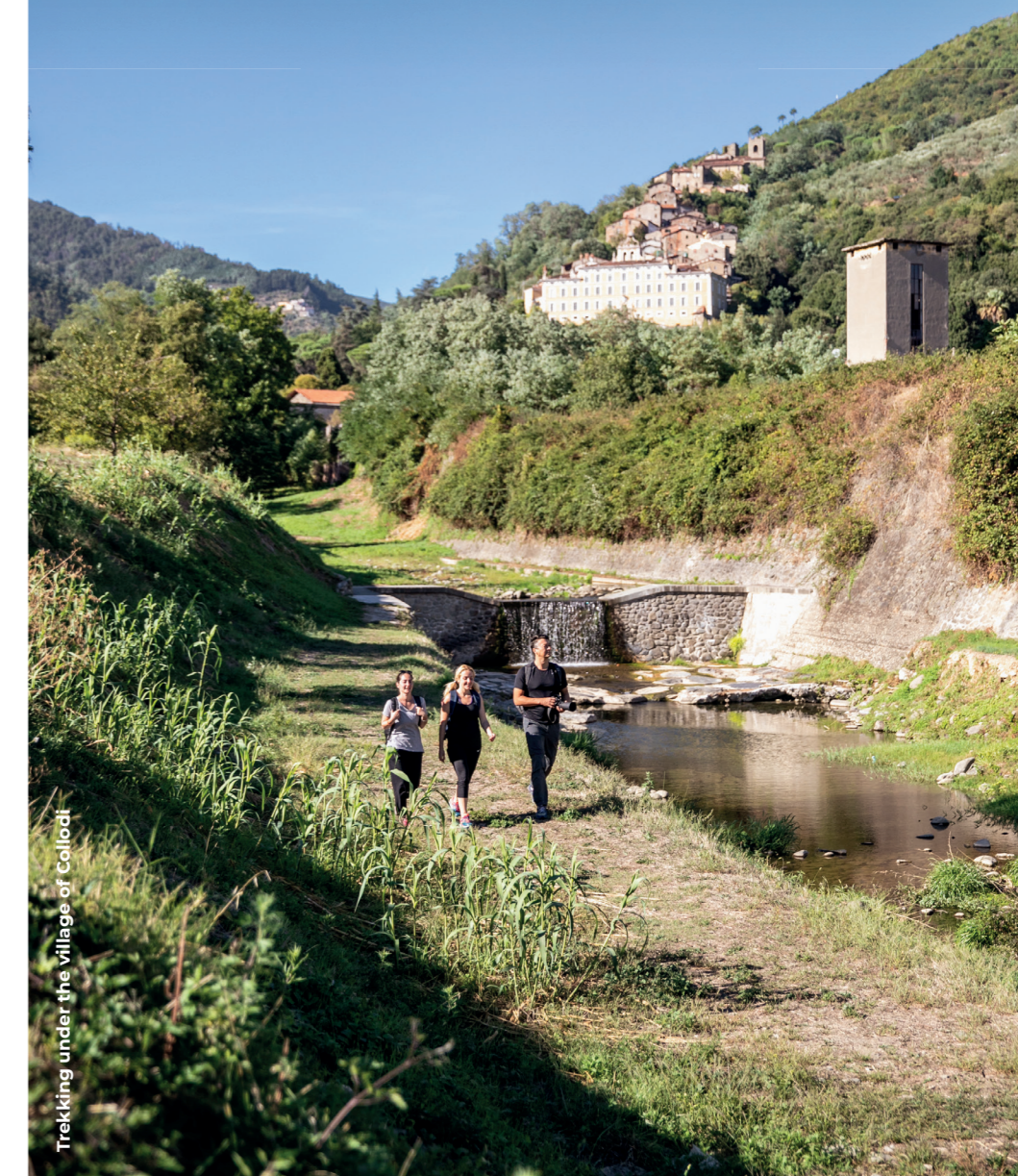
Trekking under the village of Collodi