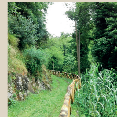
The route goes through the forest