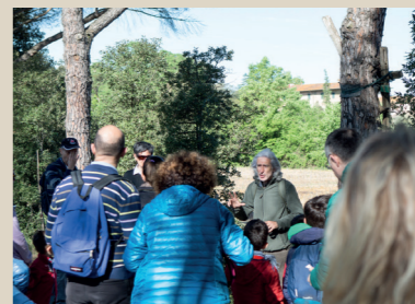
What the environmental guides have to say