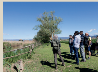
Guided visit to the Marshland

Do not forget to take a camera with you: this itinerary is perfect for lovers of naturalistic observation and of photography. Far from the chaos of life, in the silence of the marshland, you will come across wonderful glimpses of wild life, to be immortalized by a click.