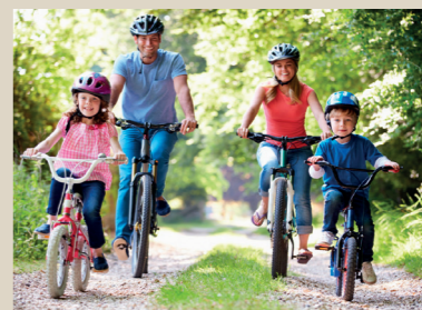
The mountain bike is ideal for trips with all the family