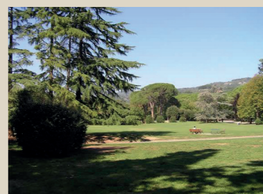
The Thermal Park at Montecatini