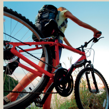
A moment of rest along the way