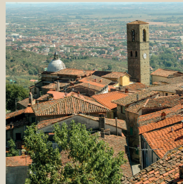
The historical centre of Massa